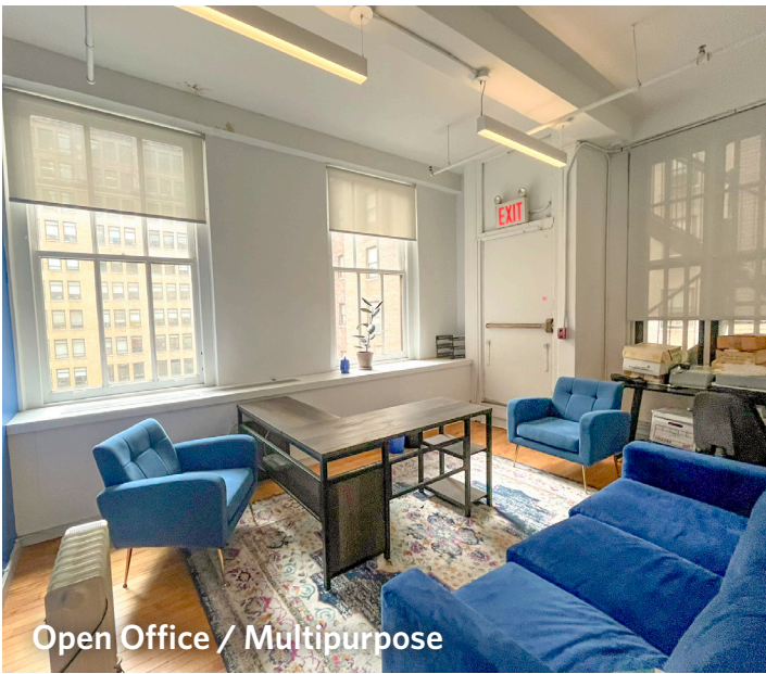
Open Office / Multipurpose